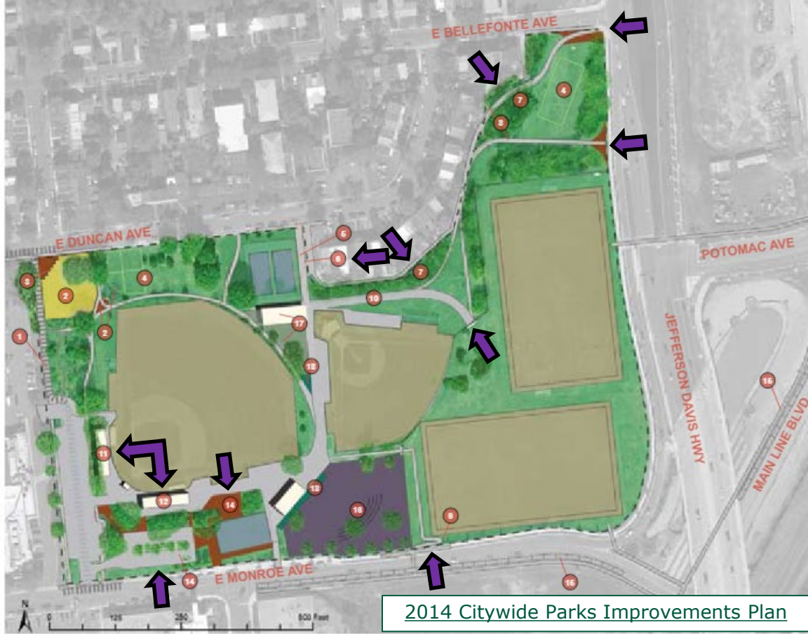
2014 Citywide Parks Improvements Plan