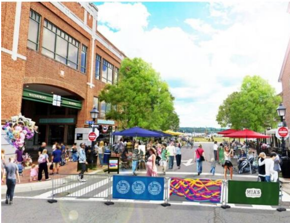
Rendering of the unit block of King Street with street closure