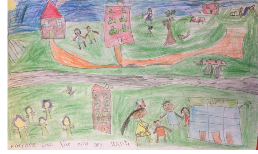
Fair housing through the eyes of a kindergartener at William Ramsey Elementary

talk, how they choose to worship, the language they speak at home, or a disability.